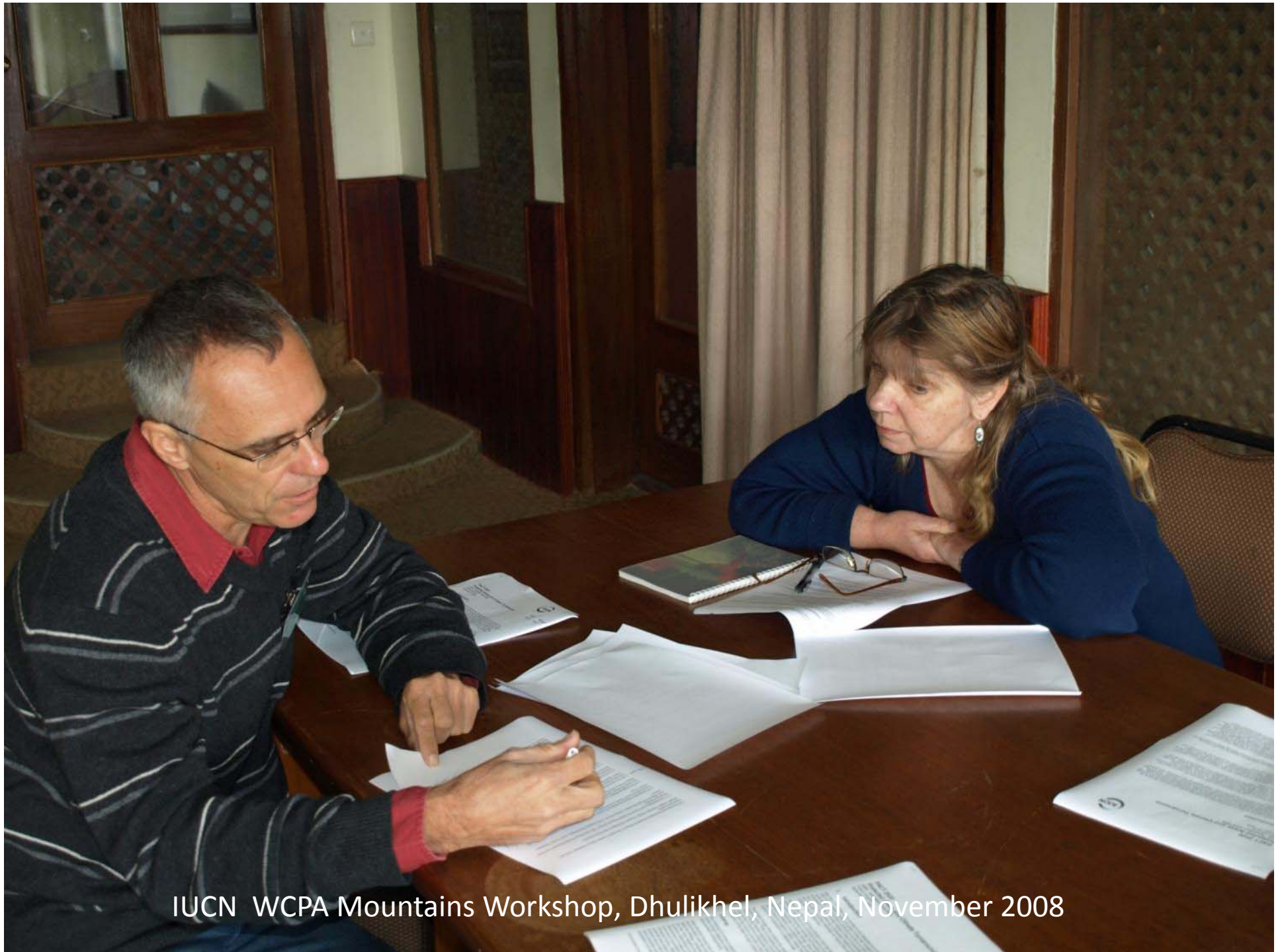
IUCN WCPA Mountains Workshop, Dhulikhel, Nepal, November 2008