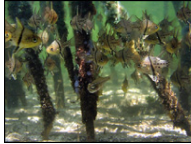
Mangroves provide shelter for spawning fish

"We need to minimise human impacts such as pollution, overfishing or unsustainable coastal developments," says Gabriel Grimsditch, one of the authors of the coral report.