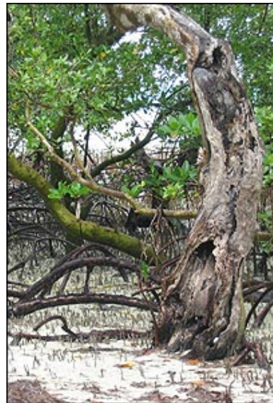
Mangrove forests likely to survive should be protected, the authors say

The reports are the first publications in a series by the IUCN on the impacts of climate change on the natural world.