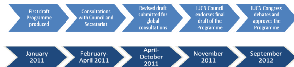
Figure 1: IUCN Programme 2013–16 Development Timeline

Over the next six months, consultations on the draft Programme will be enabled through the IUCN Members’ Portal, the Regional Conservation Forums in 2011 and via IUCN’s networks. These consultations will result in presentation of a final draft of the 2013–16 Programme for consideration at the 2012 World Conservation Congress, during which IUCN Members will debate and ultimately approve the document.