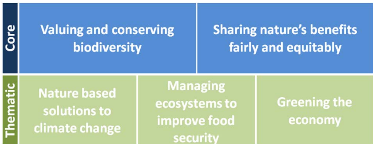
Figure 2: The IUCN Programme 2013–16

In the Programme 2013–16, two Core Programme Areas are being proposed. IUCN has been dealing with valuing and conserving biodiversity since its inception. In this regard, the tools and standards under Valuing and Conserving Biodiversity represent IUCN at its best, and are areas where IUCN has unparalleled expertise. However, this has not resulted in halting biodiversity loss; therefore it is imperative that IUCN develop comparable tools and standards for the way its work for biodiversity conservation involves people and ensures their needs by way of rights, equity and governance. It is in this context that Sharing nature’s benefits fairly and equitably is proposed as a new core programme area.