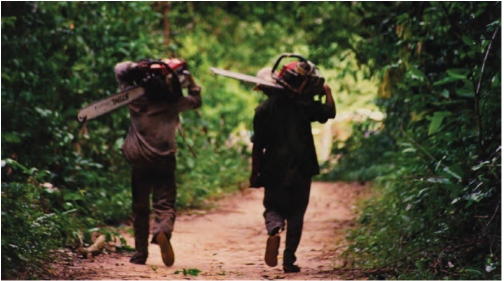
Deforestation accounts for up to 20 percent of the global greenhouse gas emissions that contribute to global warming