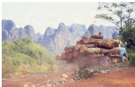
Deforestation of closed tropical rainforests could account for the loss of as many as 100 species a day