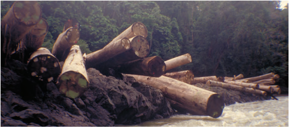
Forests ensure environmental functions such as biodiversity, water and soil conservation, water supply and climate regulation