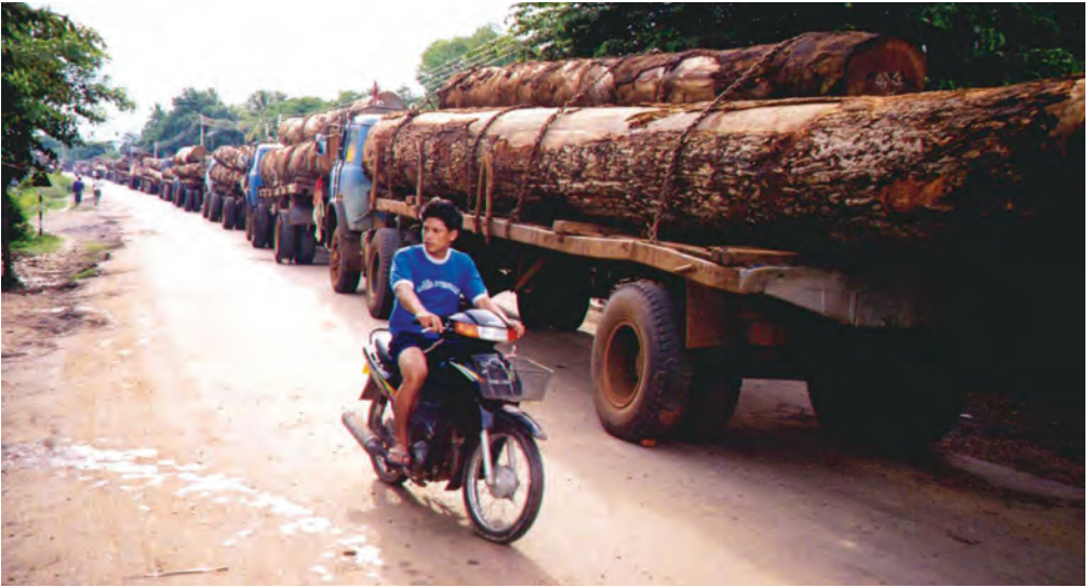
Each year about 13 million hectares of the world's forests are lost due to deforestation