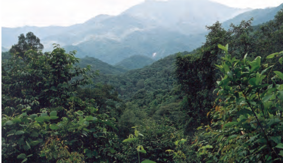
Forests are home to 300 million people around the world