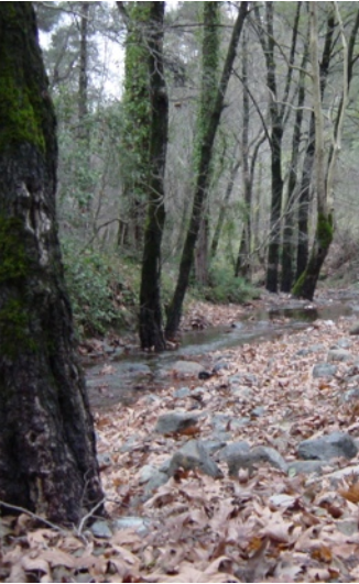
Forest day 3

CIFOR, the Collaborative Partnership on Forests (CPF) and the Government of Denmark are hosting Forest Day 3 at the Radisson SAS Falconer Hotel in Copenhagen. The event will focus on ensuring forests are high on the agenda for future climate outcomes and work beyond Copenhagen. IUCN is participating in the organization of Forest Day as a member of CPF.