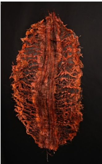
(Re-) Cycles of Paradise

The exhibit, (Re-) Cycles of Paradise, presents international artists who investigate issues of gender and climate change and how they are interrelated in a myriad of ways—from video installation to fine art, sculptures, and site-specific artistic interventions. The goal is to engage the participants and visitors of the COP15 conference with thought-provoking and interactive art in order to understand and recognize the issues at hand on a deeper, more intuitive level. The location of the exhibit will be the Copenhagen Conference Center in Hall 55.