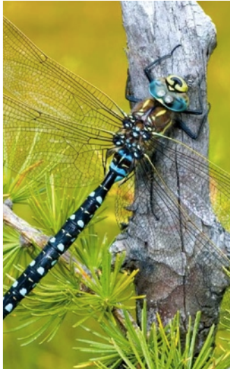
Biodiversity in trouble – Ways forward in a changing climate

Events IUCN is organizing or contributing to