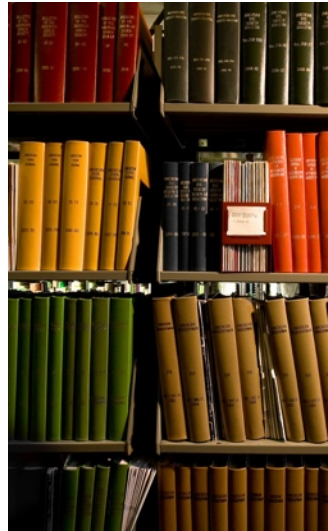
Wealth of nature: ecosystem services, biodiversity and human well-being

Tuesday, 15th December 19:00 Ny Carlsberg Glyptotek Museum invitation only