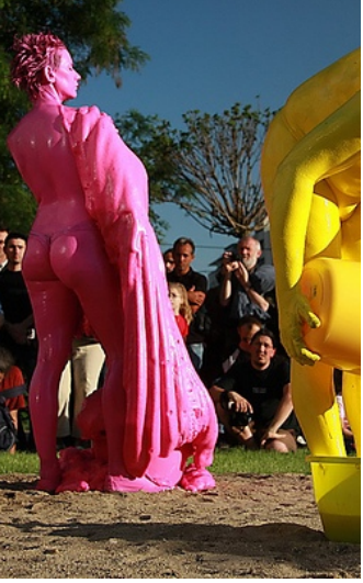
Street Theater on Gender and Climate Change

We have commissioned Theater for Africa (TfA), a professional theater/music group from Capetown, South Africa that was a leader of the anti-apartheid theater movement and is now internationally renowned and awarded for its performances throughout the world. TfA is preparing three 10-minute street theater performances on gender and climate change that will be performed in rotation throughout the day during the first week of COP.