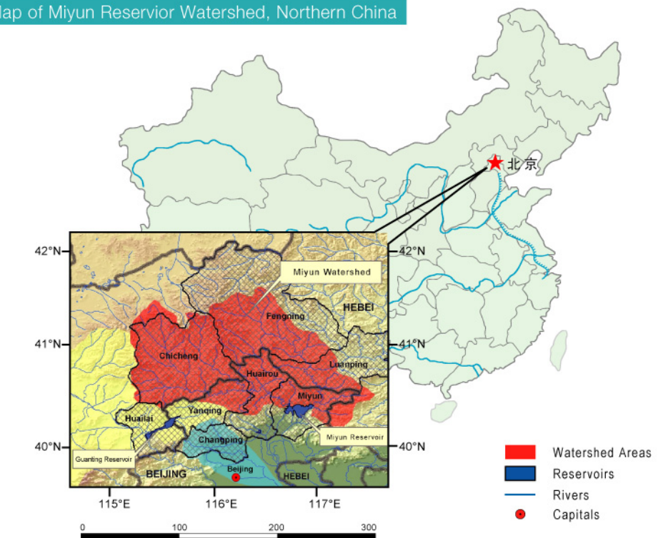
Map of Miyun Reservoir Watershed, Northern China

Located to the northeast of Beijing, the Miyun reservoir is the biggest in northern China, and the largest artificial lake in Asia. It supplies 80 percent of the drinking water for the 17 million residents of Beijing municipality, a city that faces a serious water crisis. The 15,788 km 2 Miyun watershed is a vast area that covers parts of Luan Ping, Xing Long and Cheng De counties in He Bei Province, and Miyun, Huai Rou and Yan Qing Counties in Beijing. A successful model of cross-departmental, cross-boundary collaboration to conserve the landscape functions of Miyun watershed will have significant and positive implications for China.