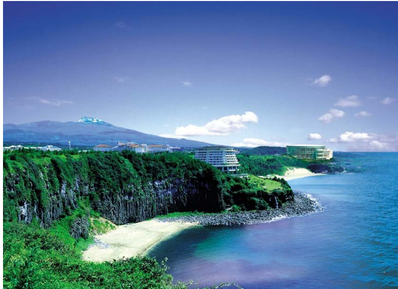
International Convention Centre and Mt. Halla, Jeju .