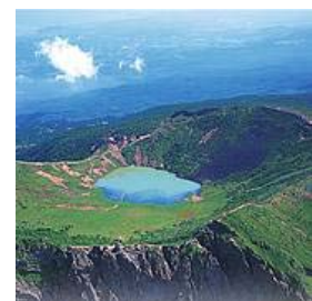
Mt. Halla, Jeju