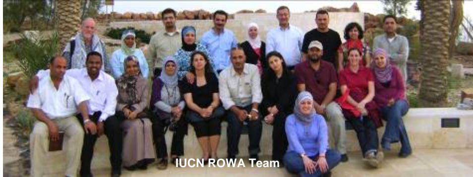
IUCN ROWA Team