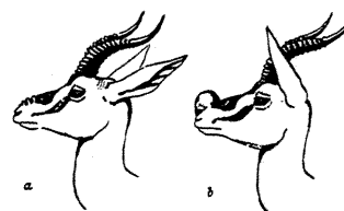
Speke's Gazelle, showing inflatable nasal pouch. Drawing by Fritz Walther.

"Although the numbers of large mammals seen were disappointing, my impression is that wildlife populations in Eritrea, if still viable, will recover rapidly under the present government and the current high level of protection and concern. I have tentative plans to return to Eritrea in early 1996 for 4-6 weeks to walk into the most inaccessible parts of the Gash-Setit (2 weeks), see more of the Semenawi Bahri (1 week), survey the Guna Guna area (ground over 8000 ft. on the border with Ethiopia) (1 week) and, if Government will permit, survey extreme northwest Eritrea (2 weeks) where I suspect Eritrea's best remaining wildlife populations will be found. . . including tora hartebeest and Nubian ibex."