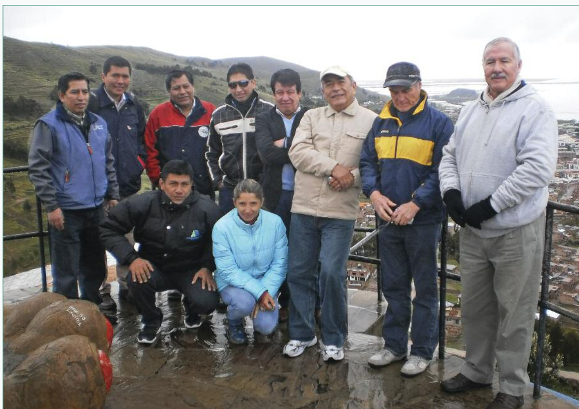
Third Leadership and Champion’s Network workshop at Chucuito Puno in Peru in the Titicaca basin.