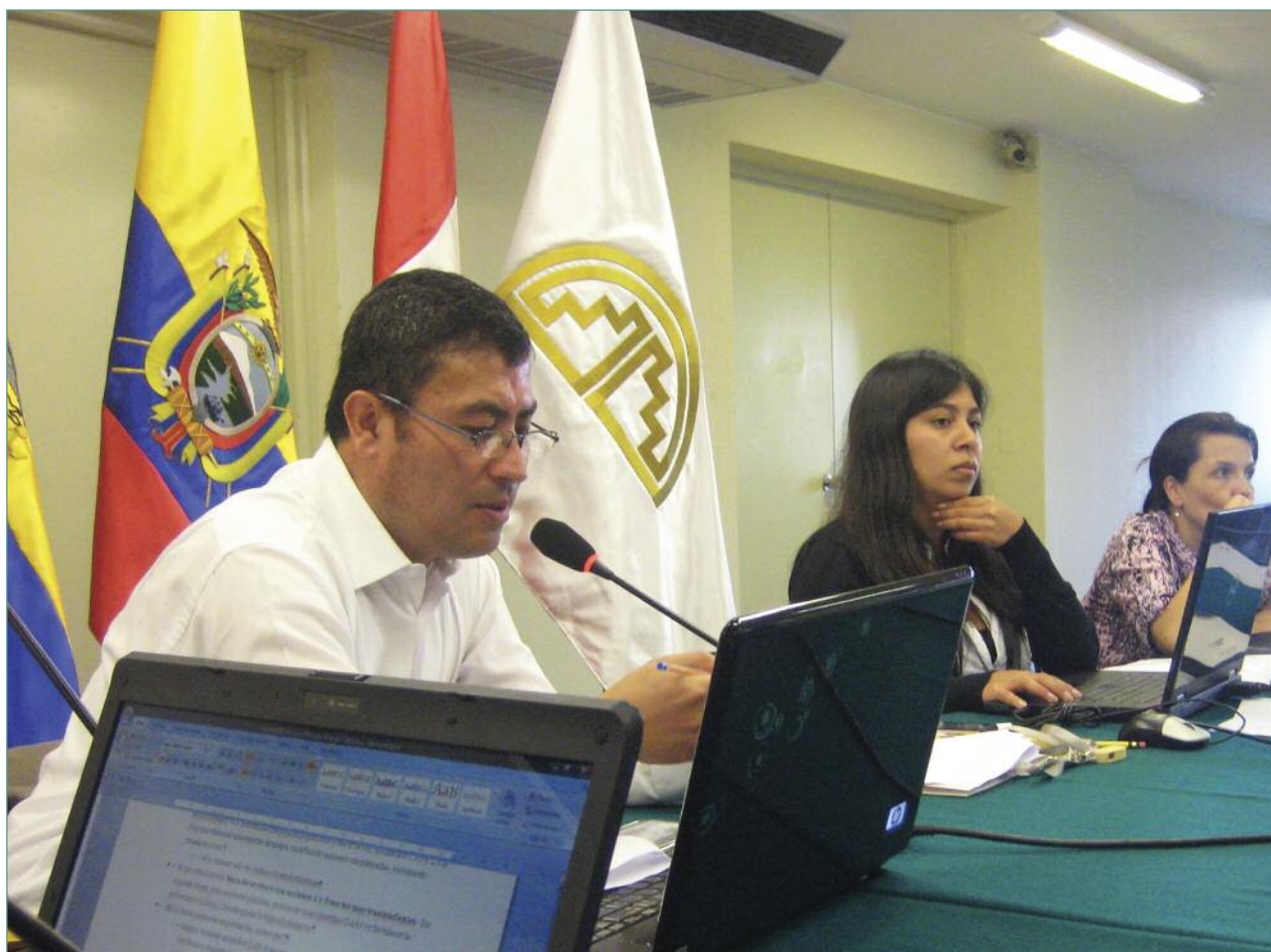
BRIDGE Workshop with the Andean Community General Secretariat.

common agreement. Significantly, a commitment to a joint monitoring system was also agreed and has since extended to basins outside the Titicaca such as the Zarumilla and Catamayo-Chira basins, both shared between Ecuador and Peru.