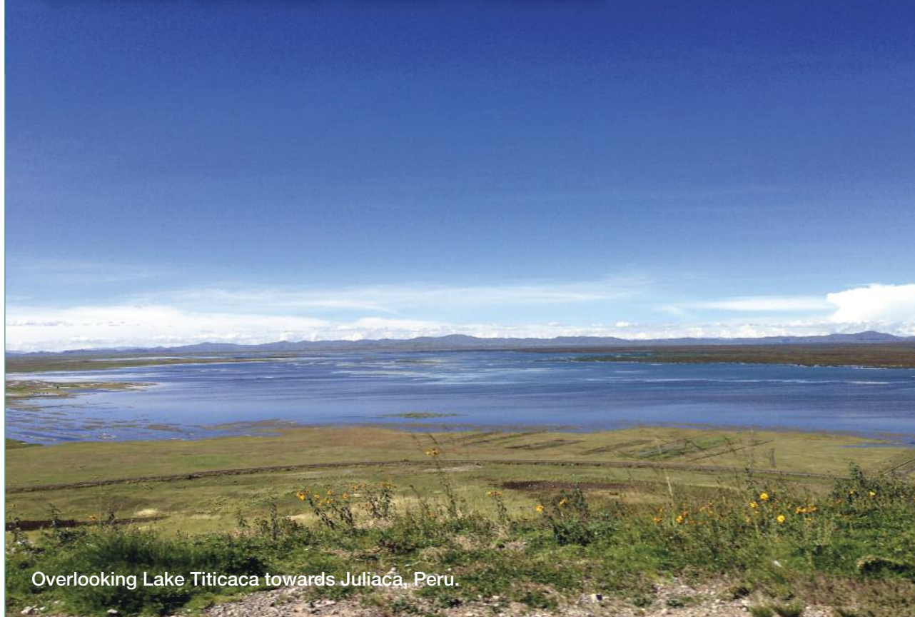
Overlooking Lake Titicaca towards Juliaca, Peru.

The experience of BRIDGE in the Andes has emphasised the need for a multi-faceted, multi-level approach to water diplomacy and transboundary river basin management. Previous existence of a binational authority has been both a benefit and a challenge given the historical political context between Bolivia and Peru. BRIDGE is designed to work around these limitations by pursuing multiple agreements at various levels. In the Andes, interventions have been found to be successfully implemented through three primary dimensions: substantive (knowledge, information, data), procedural (process, institutional, legal), and relational (personal, institutional, political). In each of these dimensions, BRIDGE has intervened and engaged at multiple scales – a crucial element of implementing water diplomacy.