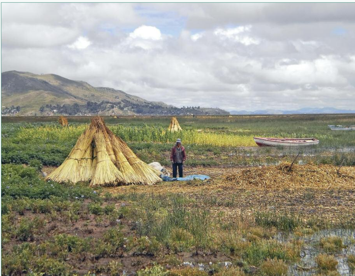
Collecting bundles of totora reeds for the islands of Lake Titicaca, in Chucuito Puno, Peru.